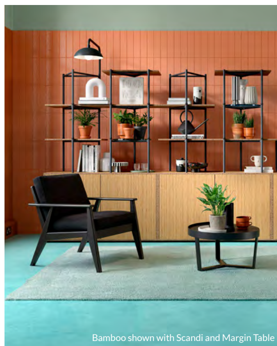
Bamboo shown with Scandi and Margin Table