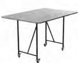
Bamboo Mobile Table width 1200, depth 800, height 740 mm