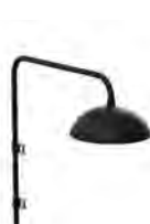
Bamboo Lamp width 760, depth 300, height 735 mm