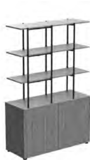
Bamboo 5 High Double Cupboard width 1200, depth 475, height 1875 mm