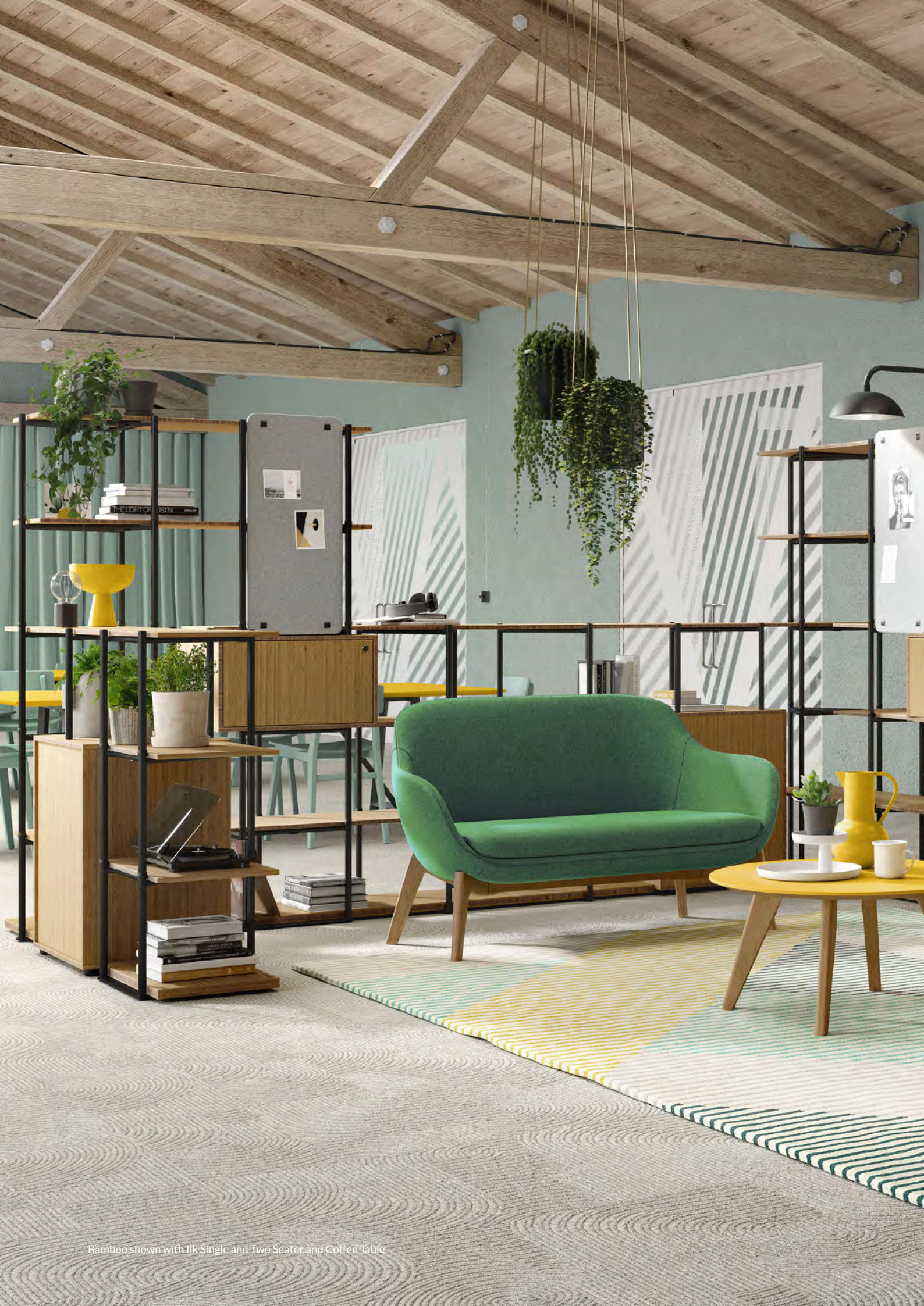
Bamboo shown with Ilk Single and Two Seater and Coffee Table