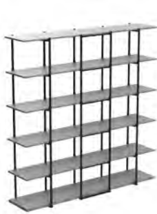
Bamboo 5 High - 1800 width 1800, depth 440, height 1875 mm