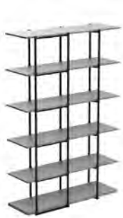
Bamboo 5 High - 1200 width 1200, depth 440, height 1875 mm

Visit bamboo.frovi.co.uk to configure your own