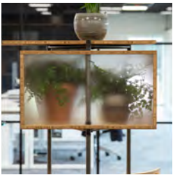
Open Perspex Back Unit