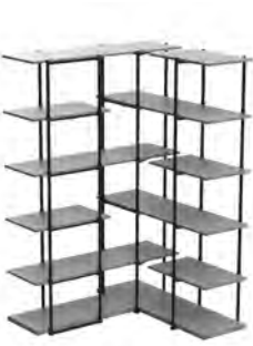
Bamboo 5 High Corner (Overlapping) width 1200, depth 1200, height 1875 mm