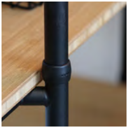
Recycled nylon (PA6) connectors